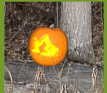
Drayton Valley Pumpkin Walk