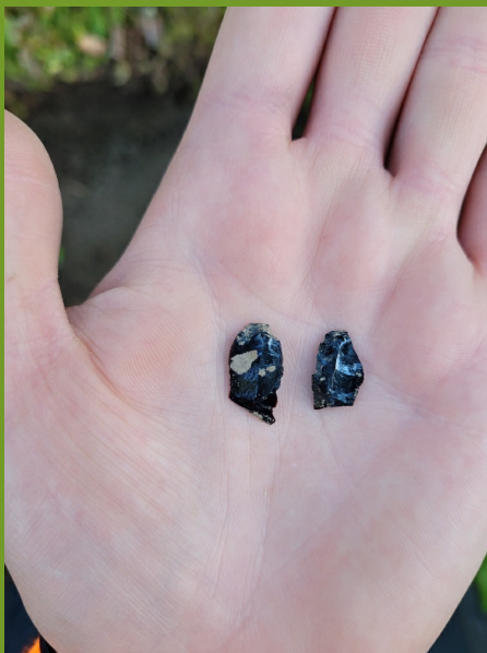
Obsidian flakes collected at FgPt-19

A final draft report is in the works and should be available at the end of January.